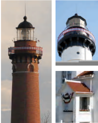
The 4th of July At Little Sable Point & Big Sable Point