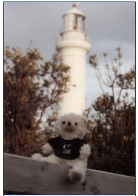
Alonzo at the Point Hicks Light 450 km east of Melbourne, Australia